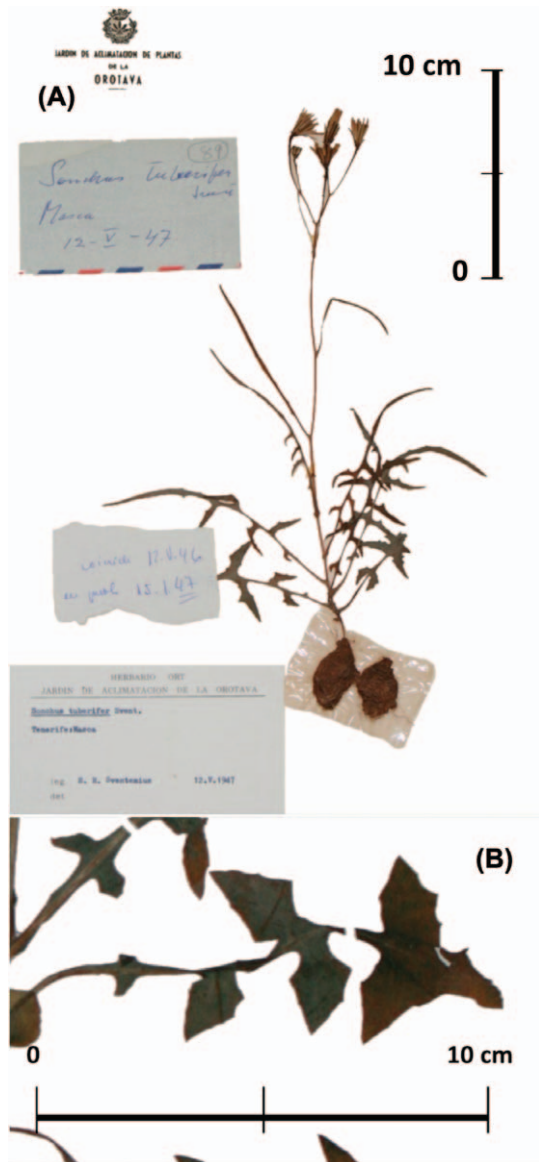
Figure 1. Types assigned to Sonchus tuberifer Svent. (A) epitype of typical variety (ORT 17199), (B) leaf detail from S. tuberifer var. latisecta Svent. lectotype (GB no. 194).

1b. Sonchus tuberifer var. latisecta Svent. (1948, p. 288)