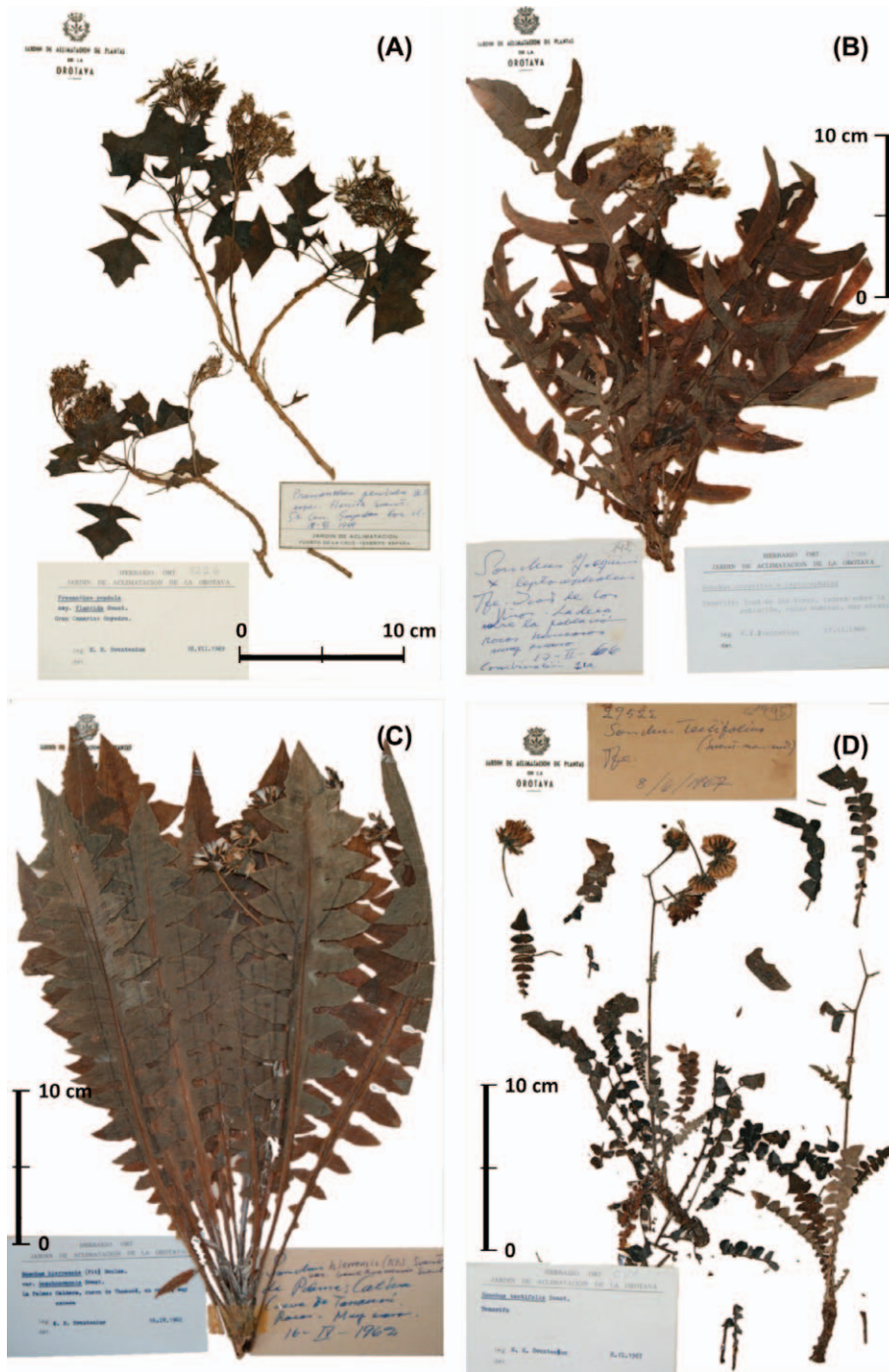
Figure 4. Types assigned to some names of taxa introduced in ‘Plantae macaronesienses novae vel minus cognitae’ (Sventenius 1969). (A) holotype of Sonchus pendulus subsp. flaccidus (Svent.) N. Kilian & Greuter (ORT 8226), (B) holotype of S. xjaquinocephalus Svent. (ORT 17056), (C) neotype of S. hierrensis var. benehoavensis Svent. (ORT 4403), (D) neotype of S. tectifolius (ORT 7119).

p. 6) – Taeckholmia filifolia (Svent.) G. Kunkel (1974, p. 28); nom. inval. (Art. 37.1) – Sonchus filifolius N. Kilian & Greuter, in Greuter (2003, p. 237), nom. illegit. (Art. 52.1).