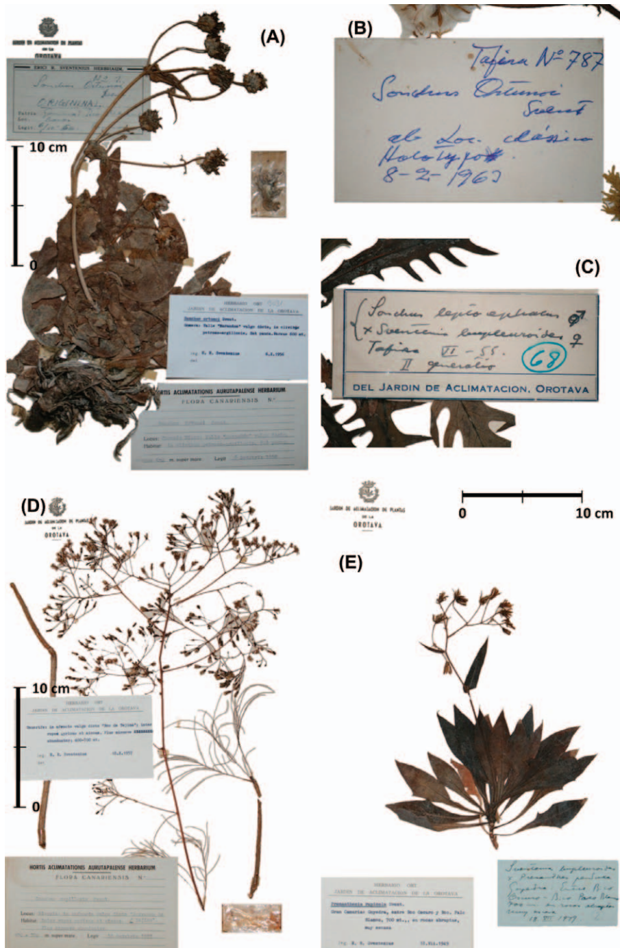
Figure 3. Typification of some names of taxa introduced in ‘Additamentum ad Floram Canariensem’ (Sventenius 1960). (A) holotype of Sonchus ortunoi Svent. (ORT 9031), (B) handwritten label for a specimen of S. ortunoi cultivated in Botanic Garden Viera y Clavijo (Tafira area, Gran Canaria) (ORT 23964), (C) handwritten label for a specimen of S. × decipiens cultivated in Botanic Garden Viera y Clavijo (ORT 9040), (D) isotype of S. capillaris Svent. (ORT 9024), (E) epitype of S. × rupicola (ORT 8231).