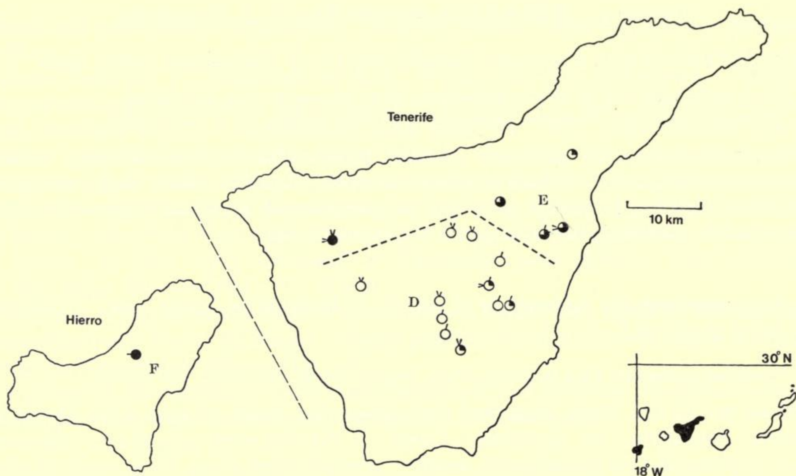
FIG. 26. Distribution and variation of subspecies of Argyranthemum adauctum on Tenerife and Hierro: D, subsp. dugourii ; E, subsp. adauctum ; F, subsp. erythrocarpon .

Ray florets 10–15 × 2–3.5 mm, white, the apex 1–3-fid; disc florets 3–4 mm, the corolla lobes yellow, the tubes white. Ray cypselas 2.5–4.5 × 1.3–6.5 mm, turbinate, ± trigonous to semi-terete in transverse section, the dorsal surface arcuate, the ventral surface slightly concave or flat, wingless, coalesced together in groups of 2–5; pappus absent or present as a narrow marginal ridge with a convex-conical floret abscission scar at the apex; disc cypselas 1.6–2.2 × 0.5–1 mm, obconical, terete, wingless, usually sterile; pappus nil. Flowering period : February to September.